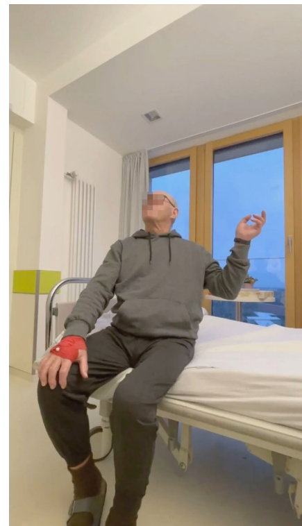
Video 1. Segment 1 shows dystonic posturing and myoclonus of the left hand and gait ataxia. Segment 2: “Paper-Toss Test” for examination of unilateral ideomotor apraxia. Segment 3 shows loss of ambulation and rapid progression of dystonia and myoclonus. Video content can be viewed at https://onlinelibrary.wiley.com/doi/10.1002/mdc3.70070

Segment 2 of Video 1 shows a brief bedside test (“Paper-Toss Test”) we use in our clinical routine to test for asymmetric apraxia. The patient is instructed to throw a piece of paper in a high arc with each hand separately. The patient shows mirror movements of both hands while attempting to grasp and release the paper. However, the movement is incomplete with the left hand. The left-sided involuntary levitation and apraxia are consistent with a posterior variant of ALP, which commonly affects the non-dominant side in CJD. 3,4 No typical early clinical signs of other ALP phenotypes were